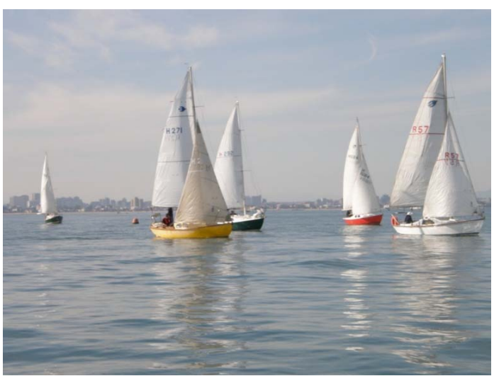
Who could forget Race 3 of the 2008 Bluebird Cup that tested all our light air sailing skills and saw Kotare come from the back of the fleet to take 2nd place.

tant as may be supposed. Actually, light weather racing calls for the greatest skill of all. Under such conditions, it is easy to sail the course without mishap, but we are interested in getting around ahead of other boats and that's a job!