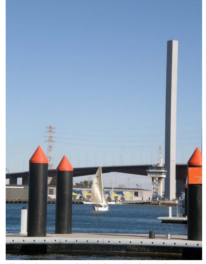
Shadow disappears under the Bolte Bridge after a night at Docklands.